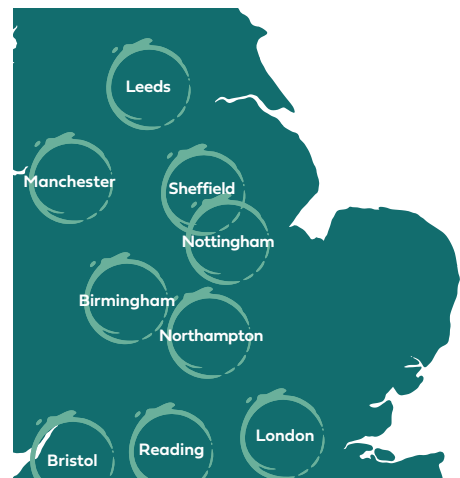
Wallace Hind advertise across multiple locations, titles and salary levels which significantly increases the volume and quality of candidates.

We use all of the major UK job boards coupled with their partner sites which reach up to 600 different local and national jobs boards. Our advertising catchment is vast in comparison to any other business in our field.